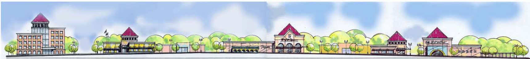
TO I-64/40 HOTEL / OFFICE DALE AVENUE UPSCALE SHOPPING / ENTERTAINMENT JR ANCHOR RETAIL UPSCALE SHOPPING (BACKGROUND) OUTPARCEL RETAIL (FOREGROUND) JR ANCHOR RETAIL BRUNO AVENUE VIEW ALONG HANLEY ROAD LOOKING EAST