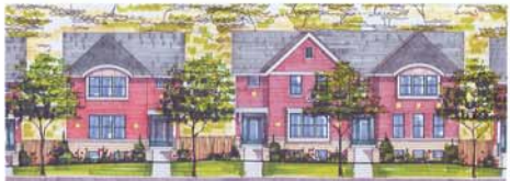
SINGLE FAMILY HOMES ATTACHED TOWNHOMES